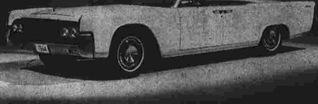
This is the Lincoln Continental convertible, the only U. S. made four-door convertible, featured in the 1964 Lincoln line. It can be seen at Moriarty Bros., 301-316 Center St.